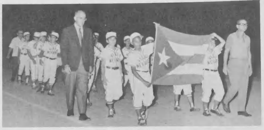
Off-the-island Little League